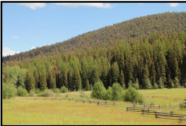
Western Spruce Budworm and Douglas-fir Tussock Moth

Emily Burt, WSU Extension Forester (509) 775-5225 x1114 emburt@wsu.edu http://county.wsu.edu/ferry/nrs